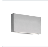
AT67010-BN-UNV Brushed Nickel